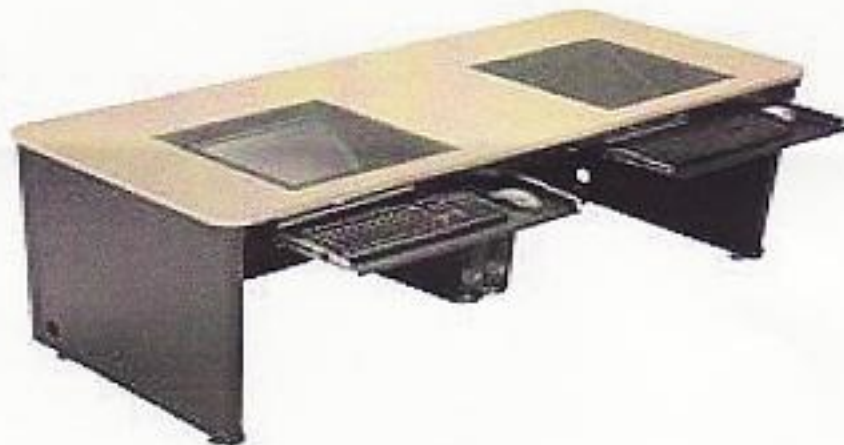
DOWNVIEW CLASSROOM SERIES DESK, MODEL DV7230-BB

This report serves to document the testing of the above sample tables to all applicable test paragraphs of ANSI/BIFMA X5.5-1998, tests for office desk and table products. All applicable tests required for complete certification were performed on the largest size sample listed above. Observations were made on all of the smaller sizes of this same series and considered to conform by similarity, as construction details were identical. The remainder of this report will show how the table submitted for testing met the requirements needed for conformance to the stated test paragraphs of the standard.